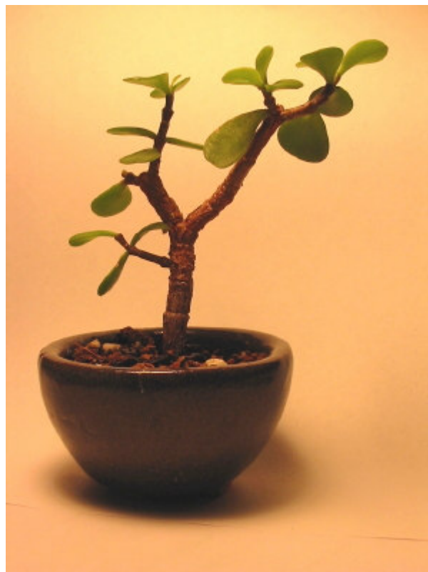
Portulacaria afra cutting taken in 2008

This workshop will be a lot of fun. It will give members an opportunity to see lots of different material and discuss with the owners how it needs to be kept. And you never know, this workshop could be the start of a future masterpiece!