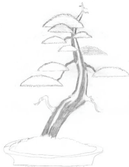
Vianney's hand tracing and drawn adjustments