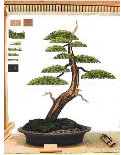
After editing with Photo Shop Pro