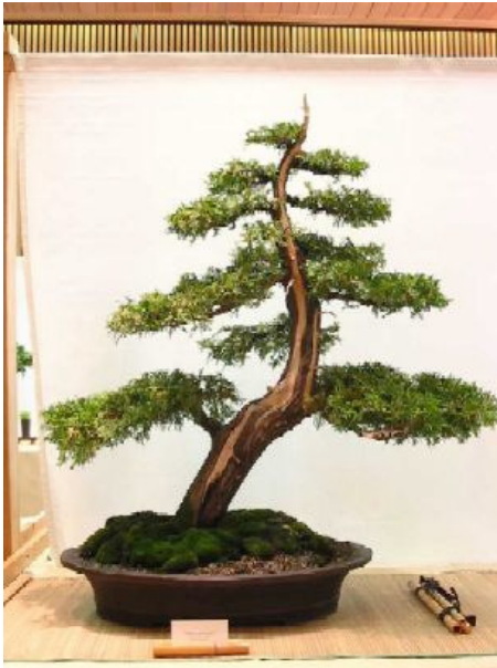
Vianney's Eastern White Cedar