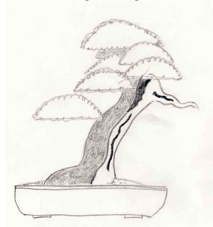
After initial styling